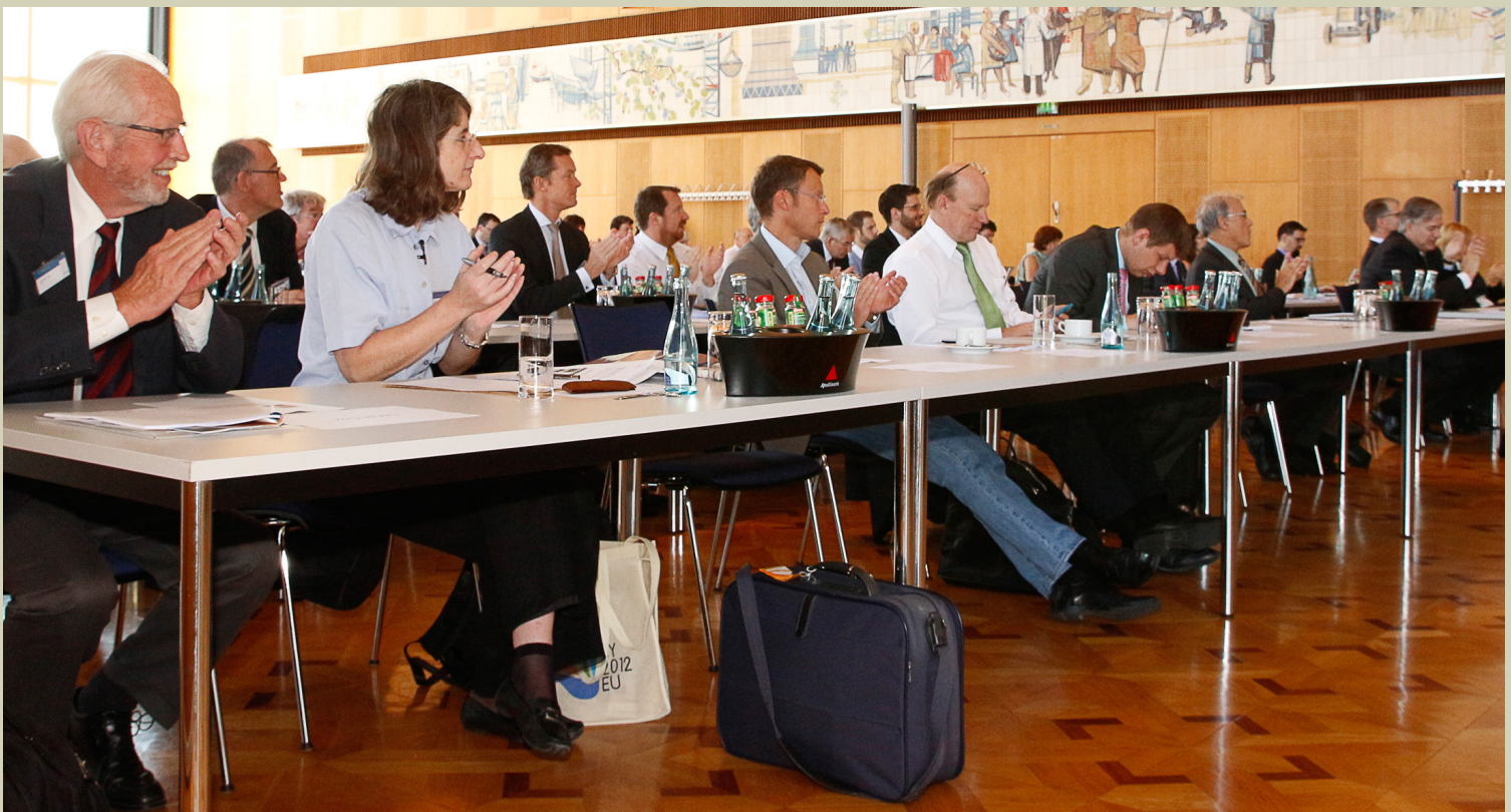
A session during the recent CEEPR European Electricity Workshop held in September 2013 in Berlin, Germany.